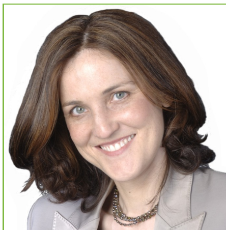
Theresa Villiers MP for Chipping Barnet

Immigration is always a difficult issue, but we are keeping our promise to introduce a cap on