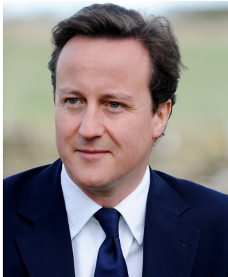
David Cameron: 'Our current voting system is simple and works well. This change would not be progress.'

What is it? On 5th May 2011, there will be a nationwide referendum to decide whether we should scrap our current voting system and replace it with one called the 'Alternative Vote' (AV).